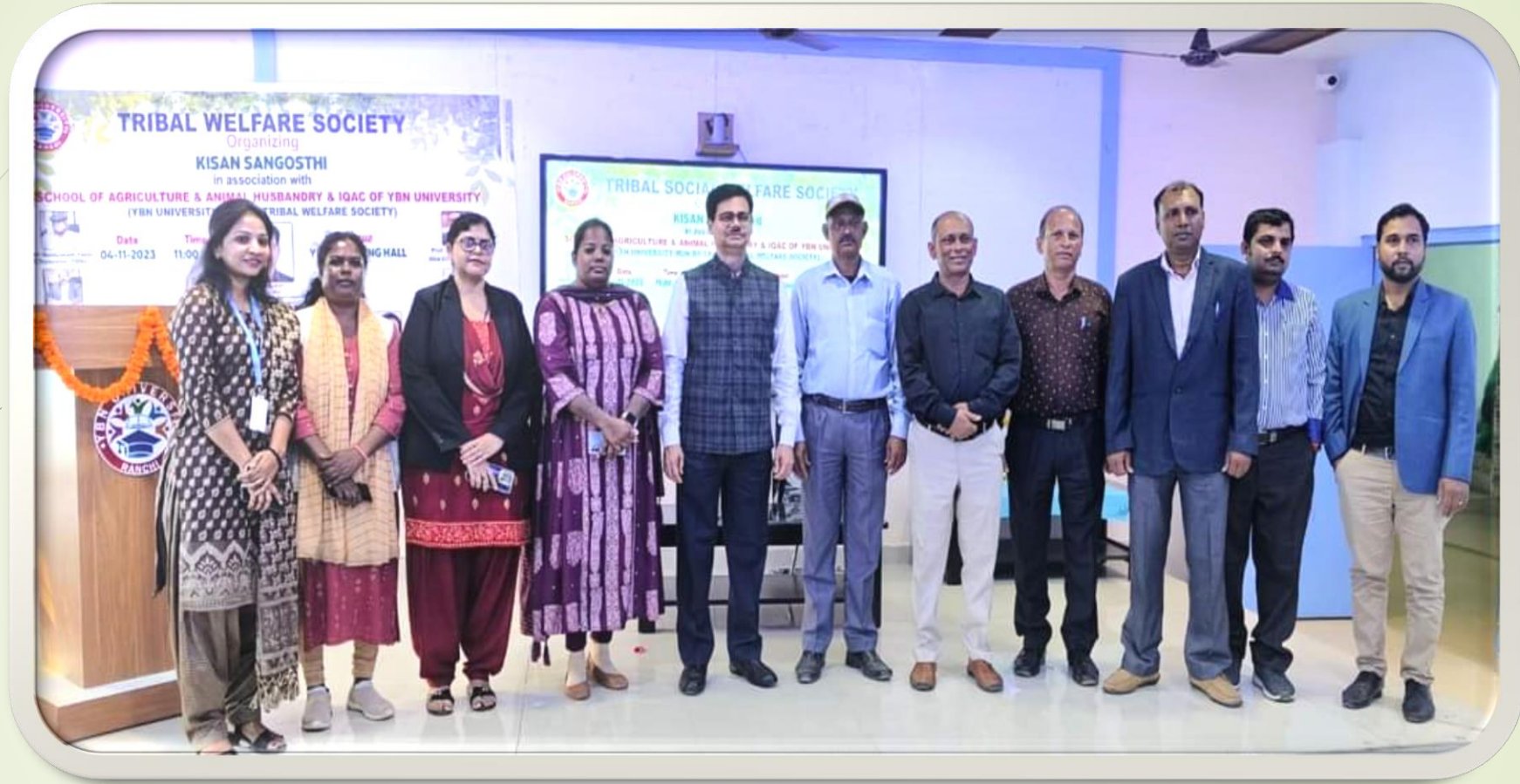
Group photo with our Chief Guest and Faculties of the YBN University